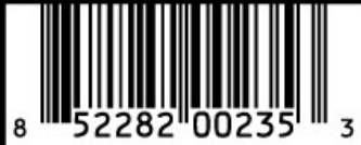
Image Type: Back

Actual Dimensions: 4.95 inches W X 3.53 inches H