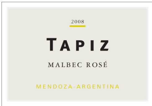
Image Type: Brand (front) Actual Dimensions: 2.2 inches W X 4.1 inches H

Image Type: Back Actual Dimensions: 2.54 inches W X 1.76 inches H