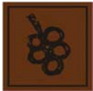
Image Type: Brand (front)

Actual Dimensions: .7 inches W X .7 inches H