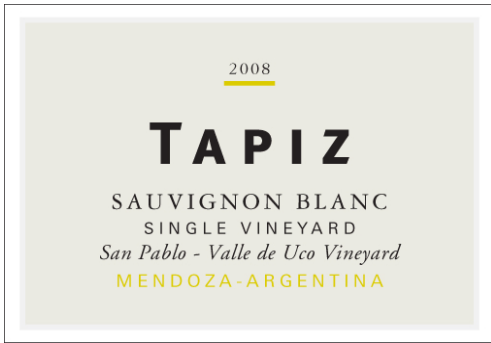
Image Type: Other Actual Dimensions: 0.63 inches W X 0.71 inches H