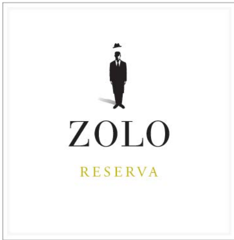
Image Type: Brand (front) Actual Dimensions: 2.45 inches W X 1.03 inches H