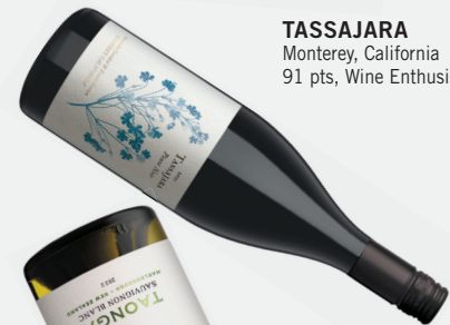
TASSAJARA Monterey, California 91 pts, Wine Enthusiast