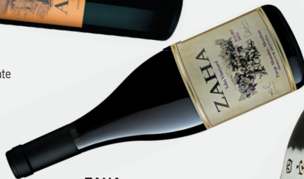
ZAHA Paraje Altamira, Mendoza 93 pts, Wine Advocate