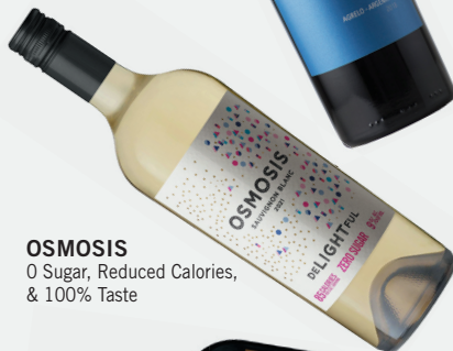
OSMOSIS 0 Sugar, Reduced Calories, & 100% Taste