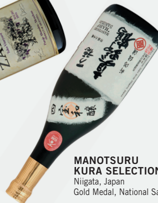
MANOTSURU KURA SELECTIONS Niigata, Japan Gold Medal, National Sake Competition