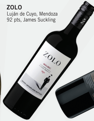
ZOLO Luján de Cuyo, Mendoza 92 pts, James Suckling