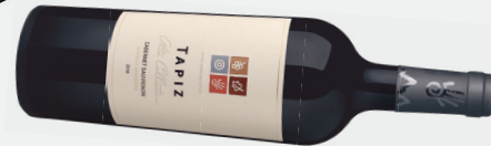
TAPIZ San Pablo, Mendoza 92 pts, Wine & Spirits